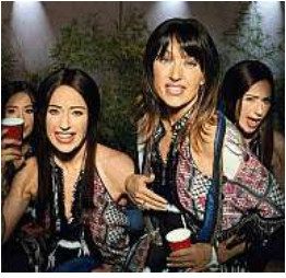
Cindy Sherman Untitled #463 2007–08 Chromogenic color print 68 5/8 x 72 inches (174.2 x 182.9 cm) Collection of John and Amy Phelan, New York