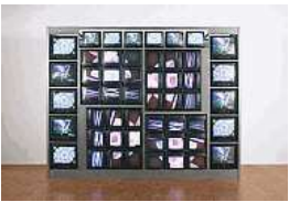
Nam June Paik Internet Dream 1994 Fifty-two monitor video installation 113 x 150 x 31 1/2 inches (287 x 380 x 80 cm) ZKM | Center for Art and Media, Karlsruhe, Germany