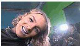
Lizzie Fitch/Ryan Trecartin Safety Pass 2016 Unique sculptural theater for Permission Streak (HD video: color, sound; 21:17 minutes); custom diving bunk, wooden platforms, message boards, carpet, paint, drop ceiling, lighting, and ambient sound Dimensions variable