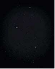
Trevor Paglen RAVEN 2 in Corona Borealis (Signals Intelligence Satellite; USA 200) 2015 Chromogenic color print 60 x 48 inches (152.4 x 121.9 cm)