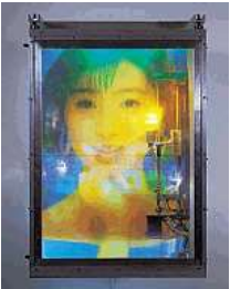
Jon Kessler Noriko 1994 Mixed media, photograph on fabric, Duratrans, lights, and motor 47 x 24 x 37 inches (119 x 61 x 94 cm) Courtesy the artist

Courtesy the artist and Marian Goodman Gallery, New York