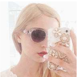
Amalia Ulman Excellences & Perfections (Instagram Update, 27th May 2014), (Matching!!), From the series Excellences & Perfections 2015 Performance; Chromogenic color print 49 1/2 x 49 1/2 x 1 1/8 inches (125 x 125 x 3 cm) Collection of Kristen Joy Watts, New York