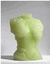
Lee Bul Vanish (Jade) 2001 Cast silicone mixed with pigment 23 1/2 x 18 x 12 inches (59.7 x 45.7 x 30.5 cm) Collection of Miyoung Lee and Neil Simpkins, New York