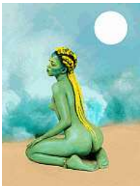
Juliana Huxtable Untitled in the Rage (Nibiru Cataclysm) 2015 Inkjet print 40 x 30 inches (101.6 x 76.2 cm) Solomon R. Guggenheim Museum, New York Purchased with funds contributed by Stephen J. Javaras, 2015