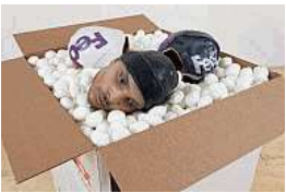
Josh Kline Saving Money with Subcontractors (Fedex Worker's Head) 2015–17 Three 3D-printed sculptures in plaster with inkjet ink and cyanoacrylate, cast urethane foam packing peanuts, vinyl, cardboard, and MDF 35 x 27 x 27 inches (88.9 x 68.6 x 68.6 cm) Courtesy the artist and 47 Canal, New York

Courtesy the artist and 47 Canal, New York