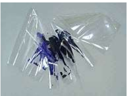
Seth Price Still, Five Hooded Men with Seated Man 2005 Signage ink screen print on archival polyester film and grommets Dimensions variable