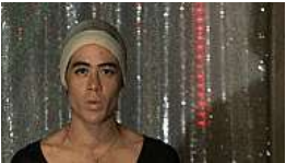
Wu Tsang Shape of a Right Statement 2008 Video (color, sound; 5:00 minutes)

Courtesy the artist and Bridget Donahue, New York