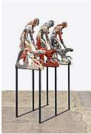
Oliver Laric The Hunter and His Dog 2015 Polyurethane, pigment, and steel Three parts, each 35 1/2 x 26 x 2 1/4 inches (90 x 66 x 6 cm) Private collection, London