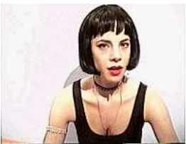
Alex Bag Untitled Fall '95 1995 Video (color, sound; 57:00 minutes)