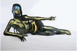
Frank Benson Juliana 2014–15 Painted bronze with Corian pedestal Sculpture: 23 x 48 x 22 inches (58.4 x 121.9 x 55.9 cm) Pedestal: 42 x 53 x 24 inches (106.7 x 134.6 x 61 cm) Koons Collection, New York