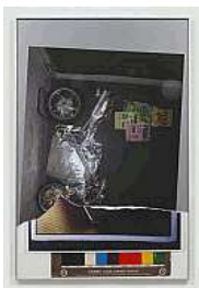
David Maljkovic New Reproductions 2014 Inkjet prints collaged and mounted on Alubond 59 x 39 3/8 inches (149.9 x 100 cm)