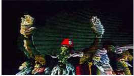
HOWDOYOU SAY YAMINAFRICAN? thewayblackmachine 2014–ongoing Thirty-monitor video installation Approximately 80 x 30 x 10 inches (203.2 x 76.2 x 25.4 cm)