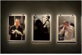
Rabih Mroué The Fall of a Hair: Blow Ups 2012 Pigmented inkjet prints Seven parts, each 51 3/16 x 35 7/16 inches (130 x 90 cm) Courtesy the artist and Sfeir-Semler Gallery, Hamburg/Beirut