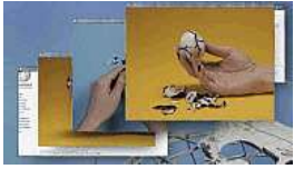
Camille Henrot Grosse Fatigue 2013 Video (color, sound; 13:00 minutes)

Courtesy the artist and Galerie Kamel Mannour, Paris