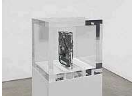
Trevor Paglen Autonomy Cube 2014 Plexiglas box with computer components 13 3/4 x 13 3/4 x 13 3/4 inches (35 x 35 x 35 cm)