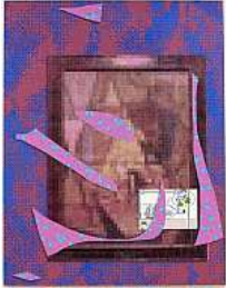
Laura Owens Untitled 2016 Flashe and screen printing ink on dyed linen 108 x 84 inches (274.3 x 213.4 cm) Promised gift of Fotene Demoulas and Tom Coté