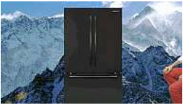
Mark Leckey GreenScreenRefrigeratorAction 2010 Samsung RFG293HABP Bottom Freezer Refrigerator, LED panel, inflatable nylon fluorescent light, DuPont Freon canister, and video (color, sound; 17:00 minutes) Dimensions variable The Museum of Modern Art, New York