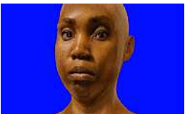
Sondra Perry Graft and Ash for a Three Monitor Workstation 2016 Video (color, sound; 9:05 minutes) and bicycle workstation