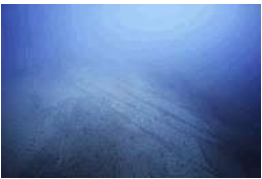
Trevor Paglen NSA-Tapped Undersea Cables, North Pacific Ocean 2016 Chromogenic color print 48 x 72 inches (121.9 x 182.9 cm) Courtesy the artist and Metro Pictures, New York