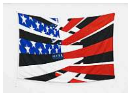
Gretchen Bender American Flag c. 1989 Fabric 72 x 108 inches (182.9 x 274.3 cm) The Gretchen Bender Estate and OSMOS, New York