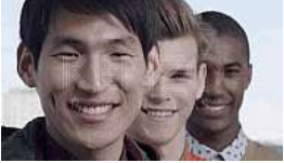
DIS Watermarked 2012 HD video (color, sound; 2:11 minutes)