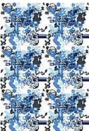
M/M Paris Wallpaper Poster 1.1 (AnnLee Colours: Anywhere Out of the World) 2000 Screenprints on paper Dimensions variable Van Abbemuseum, Eindhoven, Netherlands