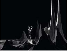
Pierre Huyghe One Million Kingdoms 2001 Video (color, sound; 7:00 minutes)