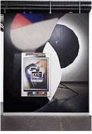
David Maljkovic New Reproductions (Wall Mural) 2017 Wallpaper made from torn inkjet prints Dimensions variable Courtesy the artist and Metro Pictures, New York