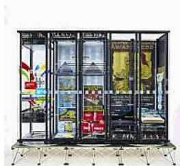
Simon Denny Modded Server-Rack Display with Some Interpretations of David Darchicourt Designs for NSA Defense Intelligence 2015 UV prints on Revostage platforms, powder-coated 19" server racks, Cisco Systems WS-C2948G switches, LAN cables, Bachmann power strips, HP Proliant 380DL G5 servers, steel trays, plexiglass and aluminum model, Maisto Humvee 1:18 model car, vinyl and plexiglass letters on plexiglass, prints on cardboard puzzle and laminated cardboard box, Picard steel tool box, screwdrivers, hammer, painting brush, wrench, socket wrench, bits, saw, UV prints on plexiglass, Tamiya 1:48 U.S. Modern 4x4 Utility Vehicle w/Grenade Launcher model cars and figures, CNC/routed MDF, VisiJet PXL Color Bond 3D print, UV print on Aludibond, Fisso stainless steel spacers, anodized aluminum panel, embossed gilded brass medallion, laser-cut plexiglass letters, powder-coated steel and aluminium components, UV print on sandblasted laminated safety glass, and LED strips 100 1/8 x 118 1/8 x 39 3/8 inches (254.5 x 300 x 100 cm)

The Museum of Modern Art, New York. Acquired through the generosity of the Committee on Painting and Sculpture and The Contemporary Arts Council of The Museum of Modern Art