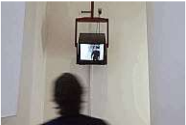
Julia Scher Mothers Under Surveillance 1993 Live black-and-white camera with 16mm lens, transformer, 25-inch monitor and bracket, cable, two DVD playback decks for fake feeds A & B, and character generator 96 x 36 x 24 inches (243.8 x 91.4 x 61 cm)