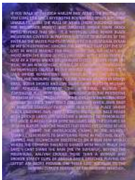
Juliana Huxtable Untitled (Casual Power) 2015 Inkjet print 40 x 30 inches (101.6 x 76.2 cm) Solomon R. Guggenheim Museum, New York Purchased with funds contributed by Stephen J. Javaras, 2015