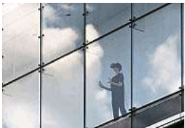
Jon Rafman View of Harbor 2017 Virtual reality headsets and 3-D simulation (color, sound; approximately 8:00 minutes) Dimensions variable Courtesy the artist