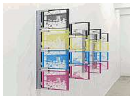
Dara Birnbaum Computer Assisted Drawings: Proposal for Sony Corporation 1992/2017 Drawings on Plexiglas in custom aluminum frames Sixteen parts, each set of four: 36 5/8 x 15 3/4 x 1 1/8 inches (92.7 x 40 x 3 cm) Courtesy the artist and Marian Goodman Gallery, New York