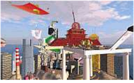
Cao Fei RMB City: A Second Life City Planning 2007 Video (color, sound; 5:57 minutes)