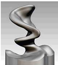
Jon Rafman New Age Demanded (Twisted Oak) 2018 CNC milled wood and varnish 18 x 22 x 11 1/2 inches (45.7 x 55.9 x 29.2 cm)