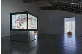
Judith Barry Imagination, dead imagine 1991 Five-channel video installation (color, sound; 15:00 minutes) with mirror, wood, and rear projection screens 120 x 120 x 120 inches (304.8 x 304.8 x 304.8 cm) Courtesy the artist and Mary Boone Gallery, New York

Courtesy the artist and Gavin Brown's enterprise, New York/Rome