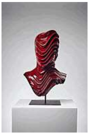
Jon Rafman New Age Demanded (Rippleface) 2017 3D print, silicone, and pigment 24 1/2 x 17 1/4 x 15 inches (62.2 x 43.8 x 38.1 cm)