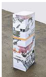
Aleksandra Domanović Untitled (mash-up) 2012 Inkjet prints (9,000 pages) 35 1/2 x 8 1/4 x 11 3/4 inches (90 x 21 x 30 cm) Aldala Collection of Diamond – Newman Fine Arts LLC, Sudbury, Massachusetts

The Museum of Modern Art, New York. Acquired through the generosity of the Committee on Painting and Sculpture and The Contemporary Arts Council of The Museum of Modern Art