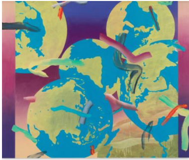
Gregory Edwards (American, b. 1981) World Painting 1 , 2015 Oil on canvas 72 x 84 inches (182.6 x 213.4 cm)