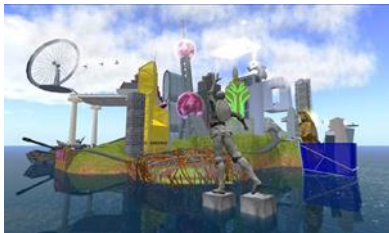
Cao Fei (Chinese, b. 1978) 曹斐 (Chinese, b. 1978) Birth of RMB City , 2009 HD video

Courtesy the artist and 47 Canal, New York