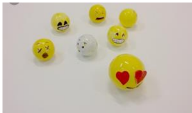
Laura Owens Untitled , 2015 Glazed porcelain Dimensions variable

Courtesy the artist and ShangART, Shanghai/Beijing/Singapore