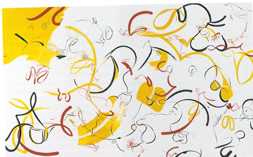
Sue Williams: Accident Pants , 1998, oil on acrylic on canvas, 82 by 132 inches; at 303.

Gavin Brown continue in this figurative mode. In one, a big, flat beige sky is impinged upon by a few cartoony clouds, most riding in from the edges, though one is adrift. At the left, near the top, is a tree limb with a few papery-looking leaves in Crayola shades of chartreuse, orange and red. Behind the branch is a slender form that appears to be its shadow, cast onto a sky transformed, in a stroke, to a theatrical backdrop. Below, a stream curves toward the distance, its contours steeply foreshortened. On its slightly crazed surface—the first signs of frost, or another semaphore of tension in the two-dimensional field?—a few leaves float.