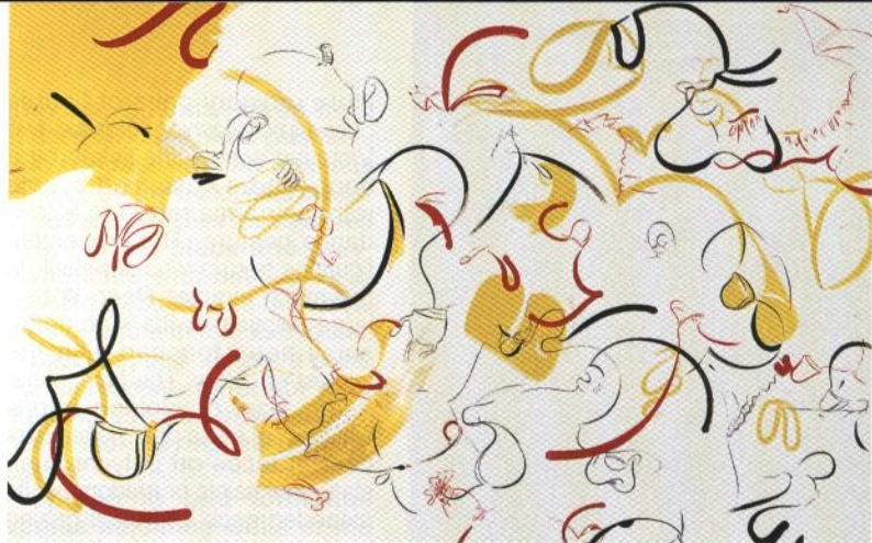
Sue Williams: Accident Pants , 1998, oil on acrylic on canvas, 82 by 132 inches; at 303.

Gavin Brown continue in this figurative mode. In one, a big, flat beige sky is impinged upon by a few cartoony clouds, most riding in from the edges, though one is adrift. At the left, near the top, is a tree limb with a few papery-looking leaves in Crayola shades of chartreuse, orange and red. Behind the branch is a slender form that appears to be its shadow, cast onto a sky transformed, in a stroke, to a theatrical backdrop. Below, a stream curves toward the distance, its contours steeply foreshortened. On its slightly crazed surface—the first signs of frost, or another semaphore of tension in the two-dimensional field?—a few leaves float.